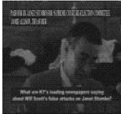
false attacks on Janet Stumbo? In an editorial entitled 'Scott's