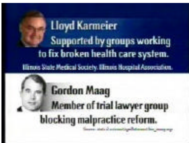
Karmeier believes courts should end frivolous lawsuits.