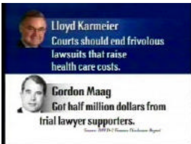
for Supreme Court. Maag will keep the current broken system.