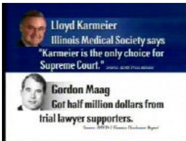
For change choose Karmeier.