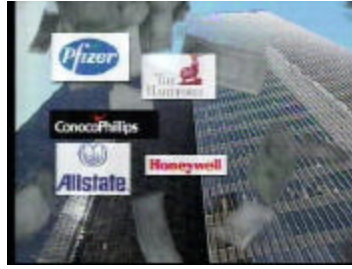
industry are spending millions to buy Lloyd Karmeier a seat