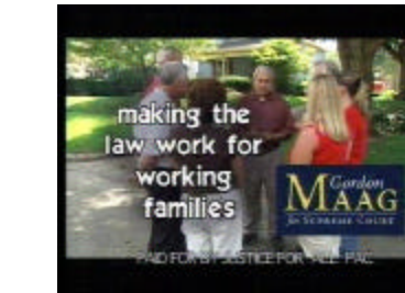
[PFB]: Justice for all PAC