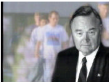
continue to support them as they outsource American jobs