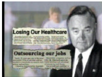
and eliminate healthcare for workers and retirees.