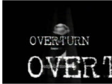
man who sexually assaulted a 6 year old girl. [Announcer2]: Maag