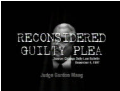
with a hatchet and steel bar. [Announcer1]: Voted to reconsider the