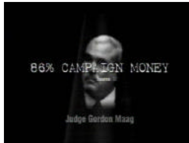
guilty plea of a man who beat a 15 year old boy into a vegetative state.