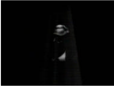
[Announcer1]: ...just as Gordon Maag today voted to overturn the conviction of a

Brand: POL-SUPREME COURT (B333) Parent: POLITICAL ADV Aired: 10/19/2004 - 10/21/2004 Creative Id: 3599874