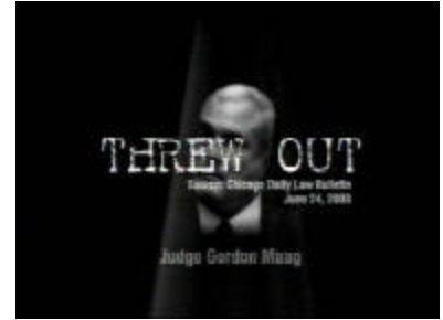
voted to throw out the conviction of a man who planned to kill his girlfriend