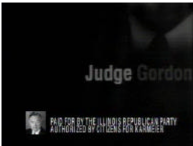
may practice before the court. [Announcer1]: Outraging a victim's