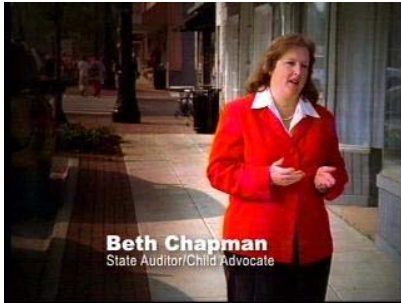
Beth Chapman State Auditor/Child Advocate

Brand: POL-SUPREME COURT (B333) Parent: POLITICAL ADV Aired: 10/25/2004 - 10/30/2004 Creative Id: 3607898