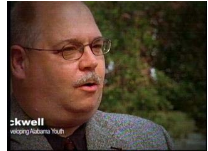
akwel Volunteering Alabama Youth

[Man]: "She has a reputation of being tough." [Man2]: "Tough but fair would be an excellent way to describe