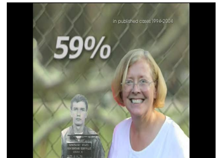
Former Justice Janet Stumbo sided with criminals fifty-nine percent of the time