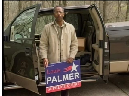
for Supreme Court Justice. [Announcer]: Who best to be on the Court, but someone who has