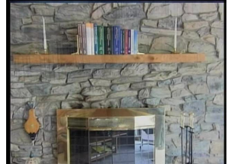
the ability, knowledge, and is the author of fifteen legal books and encyclopedias,