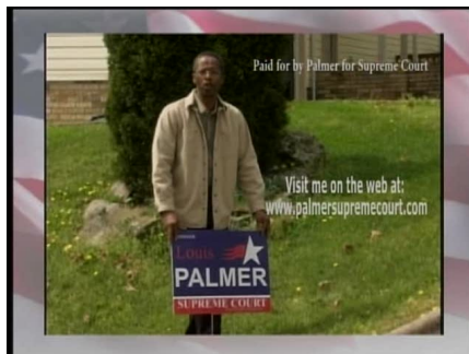
[PFB]: Palmer for Supreme Court [Web]: www.palmersupremecourt.com