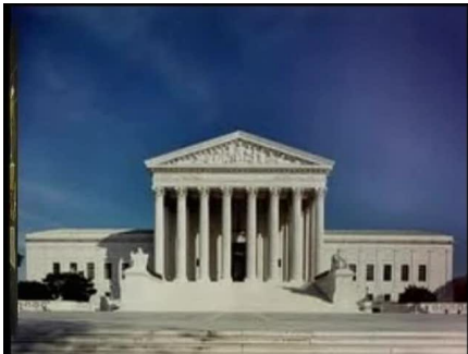
plus, three books on West Virginia Law? Someone who understands