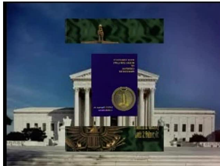
the Law, someone whose work is consulted by Law Professors, Judges, lawyers,