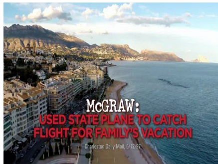
FOR HIS FAMILY'S EUROPEAN VACATION.