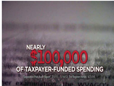
INVESTIGATORS DISCOVERED NEARLY 100,000 DOLLARS OF TAXPAYER-FUNDED SPENDING