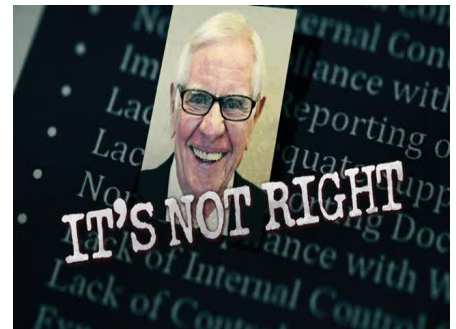
IT'S NOT RIGHT.