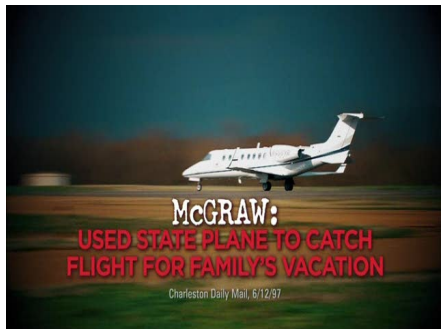
MCGRAW EVEN USED THE STATE PLANE TO FLY TO DC SO HE COULD CATCH A FLIGHT