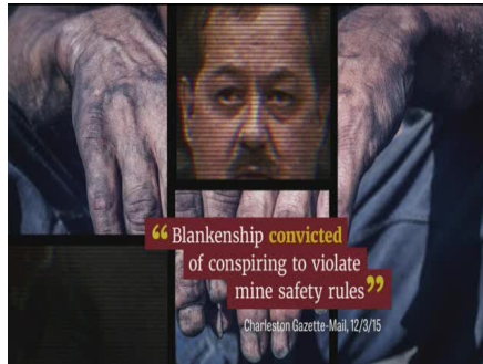
DESPITE BLANKENSHIP'S CONVICTION FOR VIOLATING SAFETY STANDARDS AT UPPER BIG BRANCH.