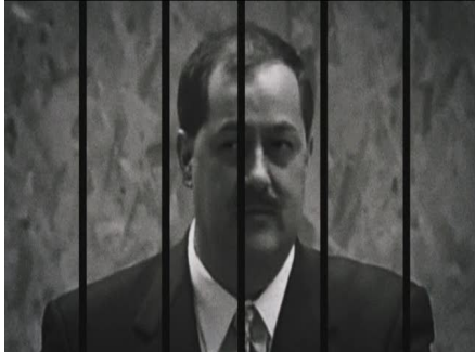
IN 2004, MASSEY ENERGY CEO, DON BLANKENSHIP,

Brand: Just Courts For WV Political Action Committee - Political Organization (B329.1) Parent: PARENT UNKNOWN Aired: 4/26/2016 9:49:03 AM Creative Id: 16427660