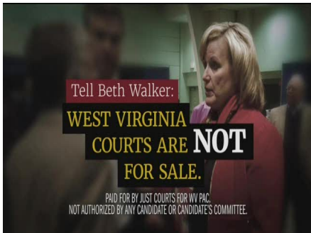
PAID FOR BY JUST COURTS FOR WEST VIRGINIA PAC. NOT AUTHORIZED BY ANY CANDIDATE OR CANDIDATE'S COMMITTEE. [PFB JUST COURTS FOR WEST VIRGINIA POLITICAL ACTION COMMITTEE].