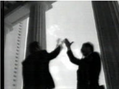
get him elected, again. Sound like a good deal? Not for the rest of us. While