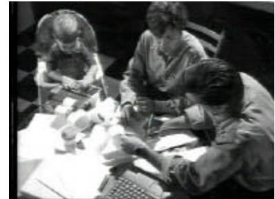
healthcare and drives your insurance bills higher. Personal injury