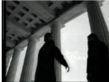
rich by filing lawsuits and taking up to half of the awarded money.