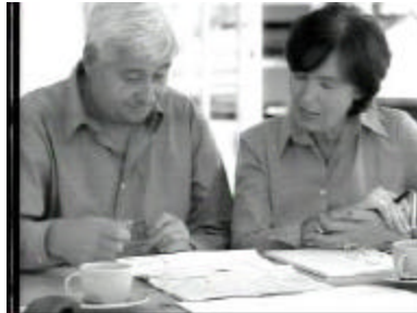
they abuse our courts, we pay the price. Lawsuit abuse threatens jobs and