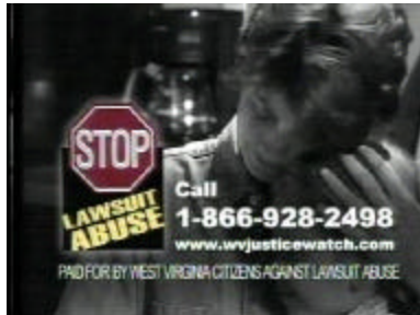
[PFB]: West Virginia Citizens Against Lawsuit Abuse