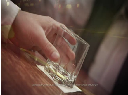
HE HAD BEEN CONVICTED OF DRUNK DRIVING THREE TIMES.

Brand: Wisconsin Alliance For Reform - Political Organization (B329.1) Parent: PARENT UNKNOWN Aired: 3/24/2016 10:09:22 AM Creative Id: 16307723