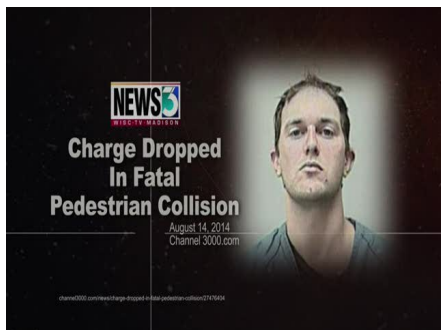
THE HOMICIDE CHARGES WERE DROPPED AND THE MAN WENT FREE.