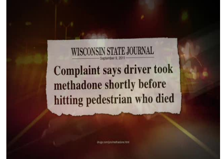
KNOWN TO CAUSE ANXIETY, CONFUSION, AND LOSS OF VISION.