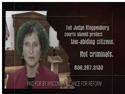
TELL JUDGE KLOPPENBURG: WE NEED TO PROTECT LAW-ABIDING CITIZENS, NOT CRIMINALS. [PFB WISCONSIN ALLIANCE FOR REFORM].