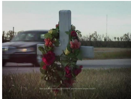
AND KILLED A SIXTY-ONE-YEAR-OLD WOMAN.