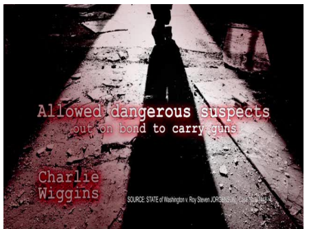
WIGGINS RULED TO ALLOW THOSE CONVICTED OF THE WORST CRIMES TO CARRY GUNS