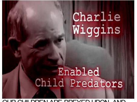
OUR CHILDREN ARE PREYED UPON, AND WIGGINS ENABLED A PREDATOR.