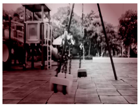
RAPISTS, MURDERERS, AND KIDNAPPERS.