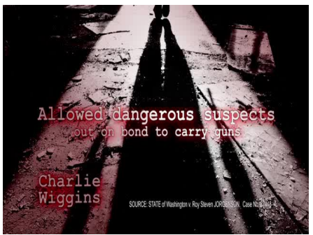
AFTER BEING RELEASED ON BOND,