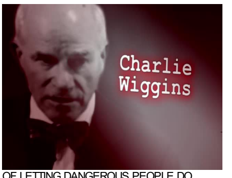
OF LETTING DANGEROUS PEOPLE DO DANGEROUS THINGS.