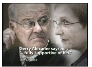
despite her driving drunk with a blood alcohol level