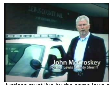
Justices must live by the same laws as everybody else."