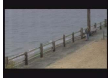
walk free after serving less than a third of his murder sentence. You could have a