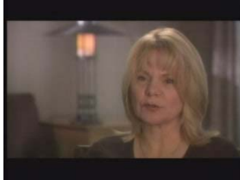
beaten and tortured to death. The Address decision let my son's killer