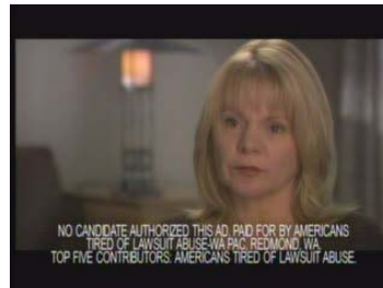
[PFB]: Americans Tired of Lawsuit Abuse