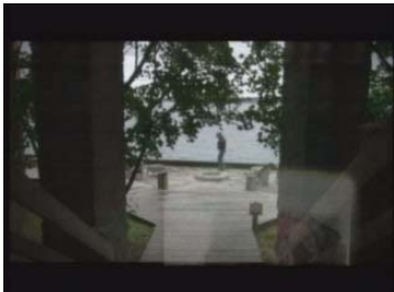
convicted murderer released on the Address decision next door