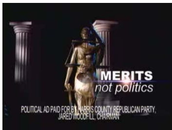
[PFB]: HARRIS COUNTY REPUBLICAN PARTY