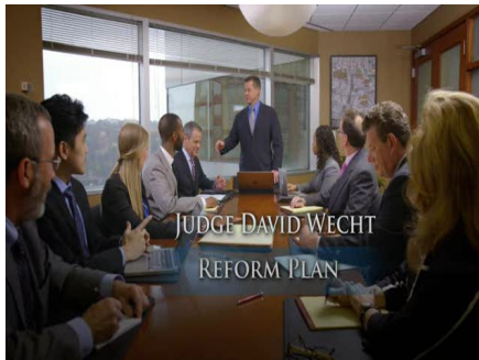
WECHT IS THE ONLY CANDIDATE WITH A PLAN TO RESTORE OUR TRUST IN THE COURT.