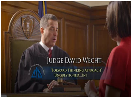
CITING HIS FORWARD THINKING APPROACH AND HIS UNQUESTIONED INTEGRITY.