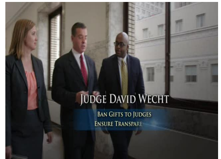
BANNING GIFTS TO JUDGES AND ENSURING TRANSPARENCY.