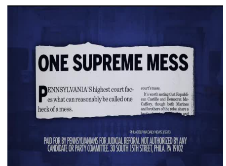
PENNSYLVANIA'S SUPREME COURT IS ALREADY A MESS.