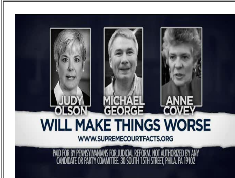
THESE THREE WOULD MAKE IT WORSE. [PFB PENNSYLVANIANS FOR JUDICIAL REFORM].