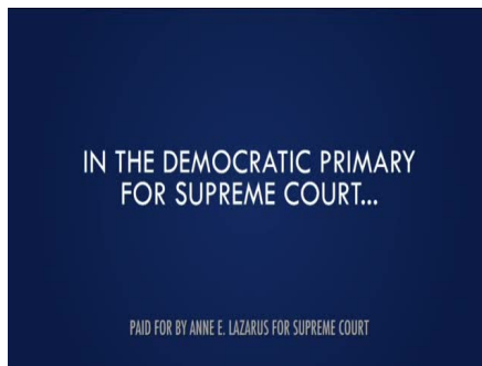
YOU GET THREE VOTES IN THE DEMOCRATIC PRIMARY FOR SUPREME COURT,