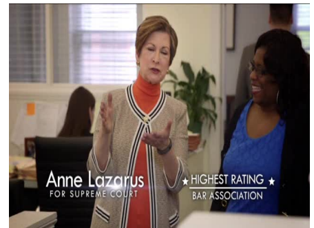
GIVEN THE HIGHEST RATING BY THE BAR.