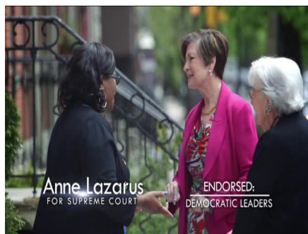
ENDORSED BY DEMOCRATIC LEADERS.