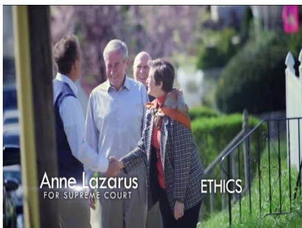
WHOSE ETHICS HAVE NEVER BEEN QUESTIONED.