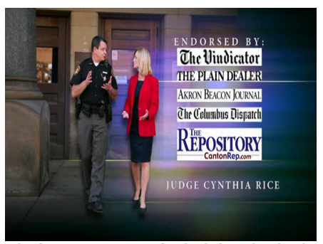
TOUGH, FAIR, THE BEST CHOICE FOR OHIO SUPREME COURT.