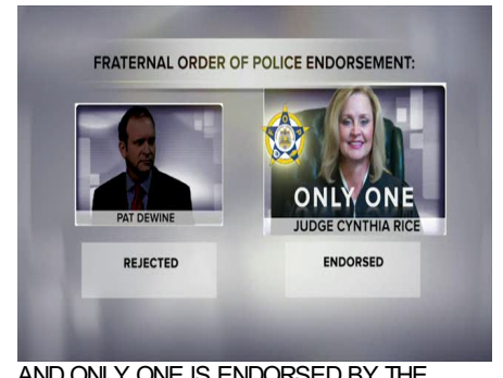
AND ONLY ONE IS ENDORSED BY THE FRATERNAL ORDER OF POLICE.