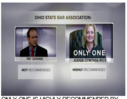
ONLY ONE IS HIGHLY RECOMMENDED BY THE NONPARTISAN BAR ASSOCIATION.