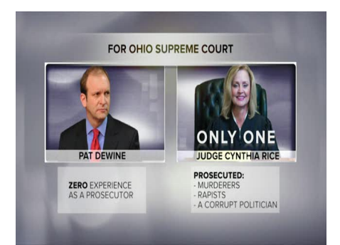
FOR OHIO SUPREME COURT, ONLY ONE