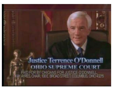
on Ohio Supreme Court.