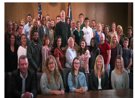
SHOULD BE THE PEOPLE'S COURT.