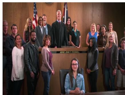
THE SUPREME COURT