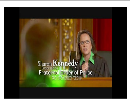
16 YEARS AS A JUDGE