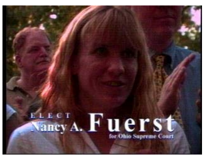
a judge, good common sense, and the ability to make tough decisions