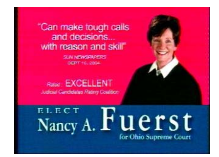
for Ohio Supreme Court. Thank you."