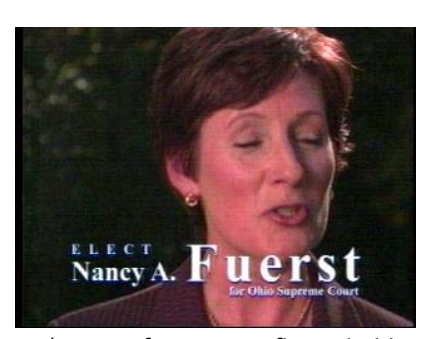
and your safety are my first priorities. With proven experience as