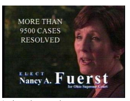
Let's make sure the courts protect our rights. Please vote for Nancy Fuerst