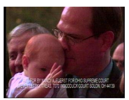
[Feurst]: "Hello I'm Judge Nancy Fuerst. Your rights, your freedom,