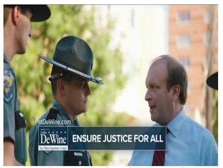
HE'LL ENSURE JUSTICE FOR EVERYONE