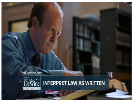
HE INTERPRETS THE LAW AS WRITTEN,