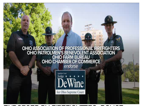
ENDORSED BY FIREFIGHTERS, POLICE, AND LEADING OHIO GROUPS.