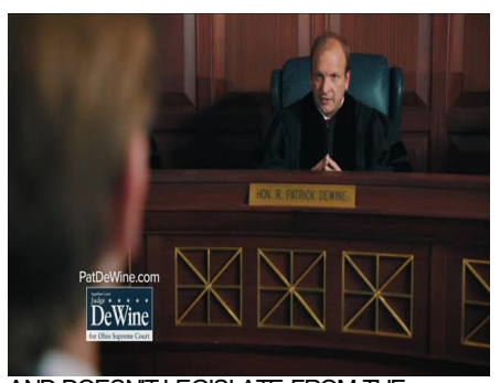
AND DOESN'T LEGISLATE FROM THE BENCH.