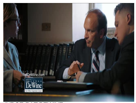
JUDGE PAT DEWINE.