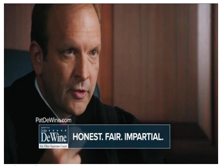
HONEST, FAIR, IMPARTIAL.