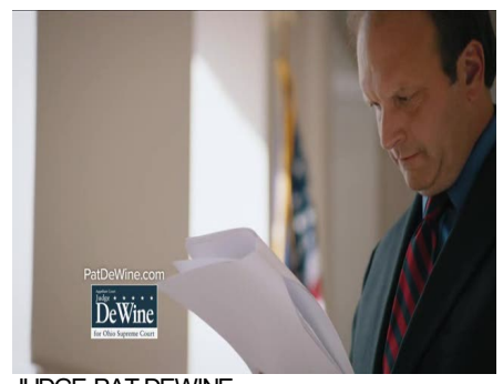
JUDGE PAT DEWINE.