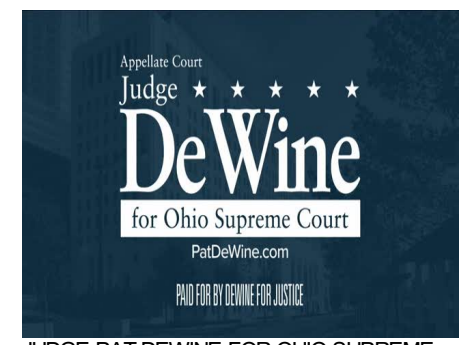
JUDGE PAT DEWINE FOR OHIO SUPREME COURT. [PFB PAT DEWINE].