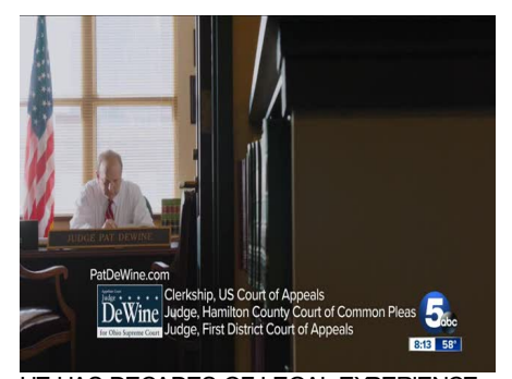
HE HAS DECADES OF LEGAL EXPERIENCE,