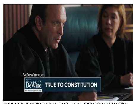
AND REMAIN TRUE TO THE CONSTITUTION.