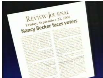
must be held accountable for her major role in that outrage. Voters,