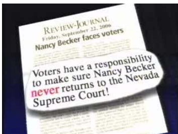
[Announcer 1]: Protect your rights. Vote Saitta for Supreme Court.