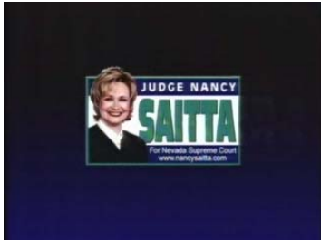
[Announcer 1]: Judge Nancy Saitta for Nevada Supreme Court. 1996.

Brand: POL-SUPREME COURT (B333) Parent: POLITICAL ADV Aired: 10/10/2006 - 10/10/2006 Creative Id: 4848845