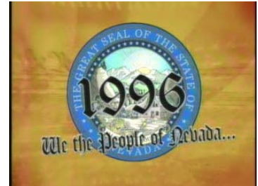
[Announcer 1]: 2003. [Announcer 2]: Justice Becker ignored it.