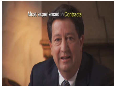
Most experienced in Contracts