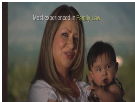
Most experienced in Family Law