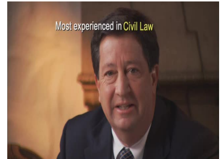
Most experienced in Civil Law