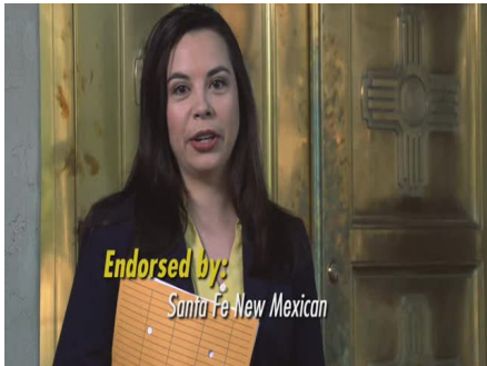
Endorsed by: Santa Fe-New Mexican