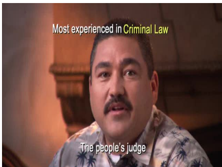
Most experienced in Criminal Law