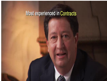
Most experienced in Contracts