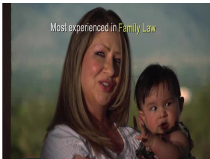
Most experienced in Family Law