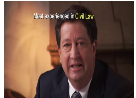
Most experienced in Civil Law