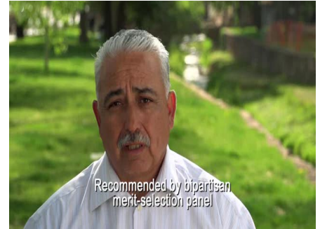
Recommended by bipartisan merit-selection panel

MY SON HAS ALWAYS SAID EVERYONE DESERVES THEIR DAY IN COURT.