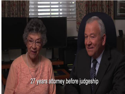
27 years attorney before judgeship

I'VE LEARNED THERE'S A TIME TO TALK AND A TIME TO LISTEN.