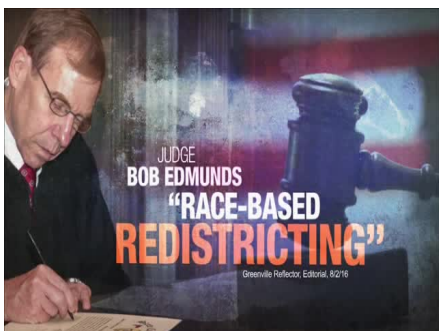
FOR MISUSING RACE FOR PARTISAN GAIN.