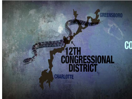
ANOTHER CALLED THE SNAKE.