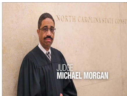
THE CLEAR CHOICE FOR STATE SUPREME COURT: