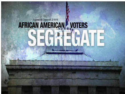
TO SEGREGATE AFRICAN AMERICAN VOTERS,