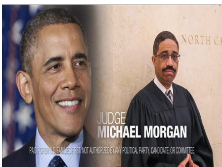
HE'S ENDORSED BY PRESIDENT OBAMA.