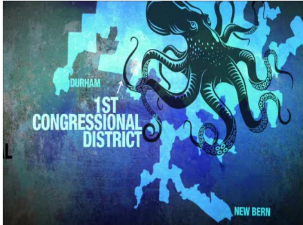
A CONGRESSIONAL DISTRICT KNOWN AS THE OCTOPUS,

Brand: North Carolina Families First - Political Organization (B329.1) Parent: PARENT UNKNOWN Aired: 11/2/2016 8:58:55 AM Creative Id: 17157711