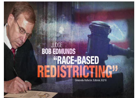
BUT FEDERAL JUDGES REJECTED EDMUNDS' DECISION