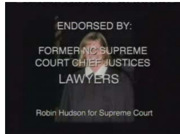
and who won't bring a personal or political agenda to the bench. And that's what you get