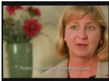
and the environment. About your family, your home, your