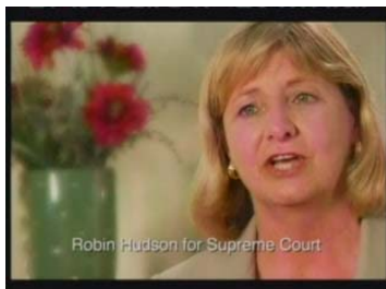
state. We need justices who are fair and impartial, with the best possible experience.