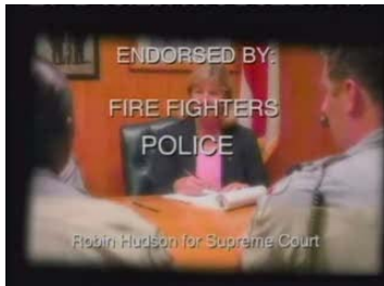
jobs, your safety. I know you want a candidate who will be fair and impartial