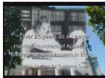
It's about protecting our system of justice and our quality of life. We have issues about property