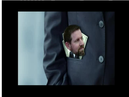
HE'S IN THE POCKET OF OUT OF STATE SPECIAL INTERESTS.