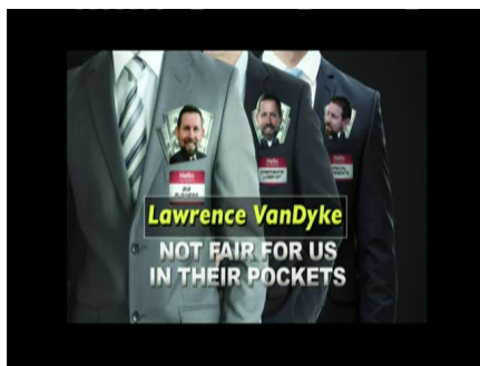
VAN DYKE CANT BE FAIR FOR US IF HE'S IN THEIR POCKETS.