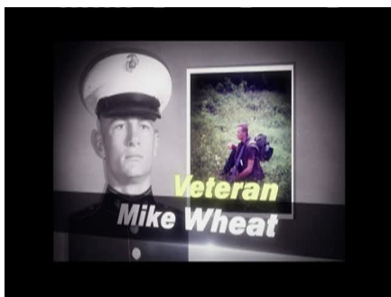
A DECORATED VETERAN WHO FOUGHT FOR HIS COUNTRY,