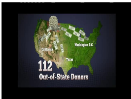
HE HAS 112 OUT OF STATE CAMPAIGN DONORS.