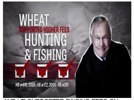
AND HE SUPPORTED RAISING FEES ON HUNTING AND FISHING LICENSES