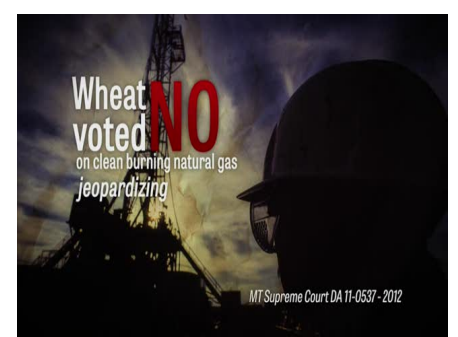
WHEAT EVEN VOTED NO ON CLEAN BURNING NATURAL GAS JEOPARDIZING MONTANA JOBS.