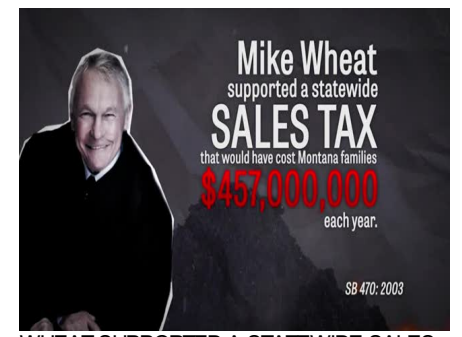
WHEAT SUPPORTED A STATEWIDE SALES TAX THAT WOULD HAVE COST MONTANA FAMILIES OVER $450,000,000 EACH YEAR.