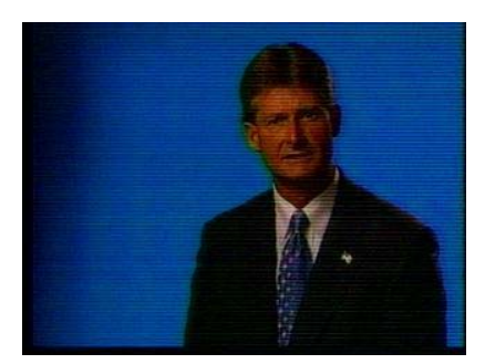
I believe Mississippi justice should not be for sale.