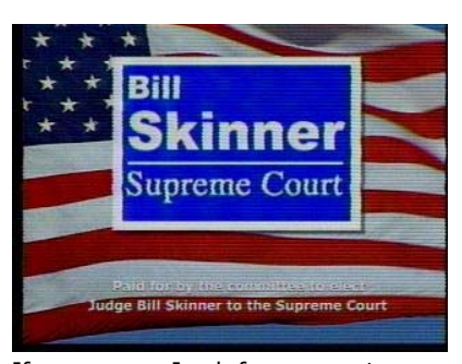
If you agree, I ask for your vote Tuesday. Thank you."