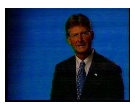
of trial lawyer money, or out-of-state special interest money.