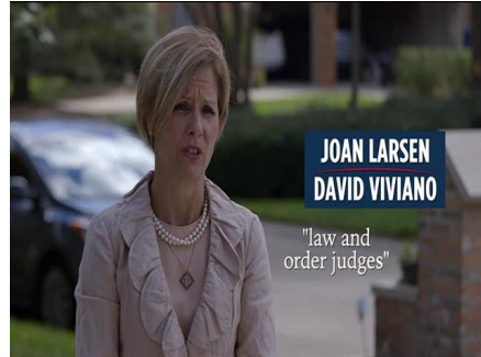
THEY ARE LAW AND ORDER JUDGES.