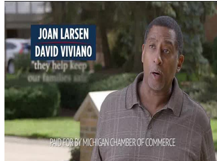
THEY HELP KEEP OUR FAMILIES SAFE.