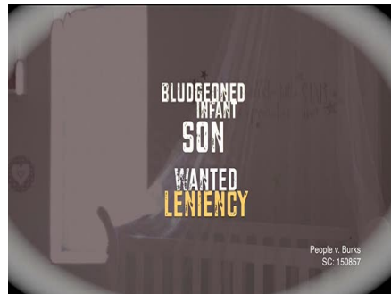
WHEN A MAN WHO BLUDGEONED HIS INFANT SON TO DEATH WAS GIVEN A LIFE SENTENCE AND WANTED LENIENCY,