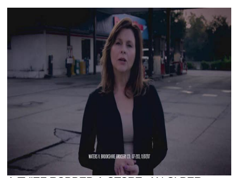
A THIEF ROBBED A STORE. AN OLDER WOMAN GOT HURT DURING THE ROBBERY.