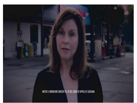
NOT THE CRIMINAL? NOT THE THIEF WHO STOLE FROM THE STORE?