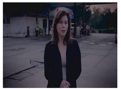
OUR LAWS KEEP US SAFE,

Brand:Citizens For Judicial Excellence - Political Organization (B329.1)Parent:PARENT UNKNOWNAired:10/6/2016 9:15:03 AMCreative Id:17043824