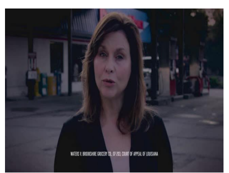
NOT THE CRIMINAL? NOT THE THIEF WHO STOLE FROM THE STORE?