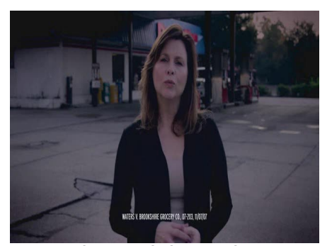
A THIEF ROBBED A STORE. AN OLDER WOMAN GOT HURT DURING THE ROBBERY.