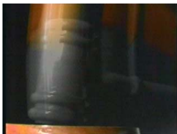
In 1995 Judge Noble imposed a sentence of a hundred