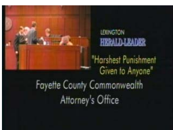
When drug addiction caused the crime rate to soar,