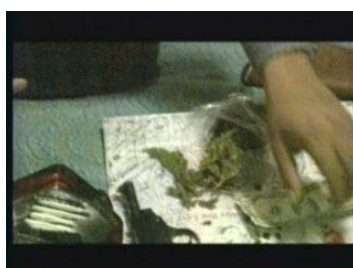
she established Kentucky drug courts.