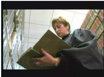
for Supreme Court. Paid for by the Committee to Elect Judge Noble to the Supreme Court.