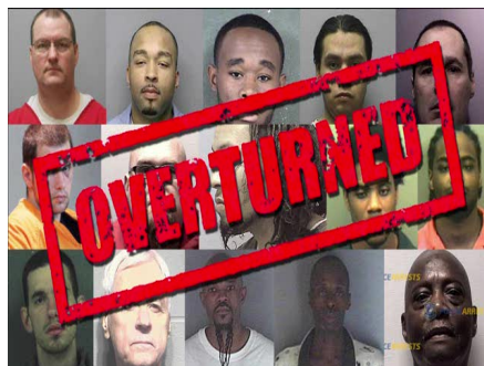
IT'S NOT ABOUT POLITICS. IT'S ABOUT FOLLOWING THE LAW.