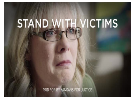
NOW, YOU GET TO CHOOSE SIDES.