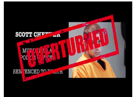
CONVICTION AND SENTENCE OVERTURNED.