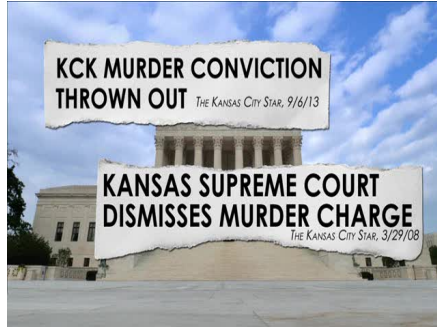
THEY REPEATEDLY PERVERT THE LAW TO SIDE WITH MURDERERS AND RAPISTS.