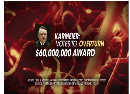
AND VOTES TO OVERTURN A MULTI-MILLION DOLLAR