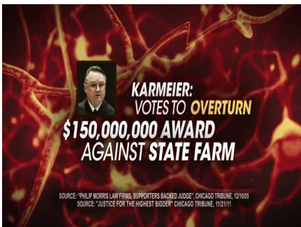
AWARD AGAINST STATE FARM FOR DEFRAUDING POLICY HOLDERS.