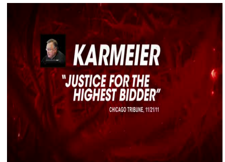
SLAMMED FOR LETTING CORPORATIONS