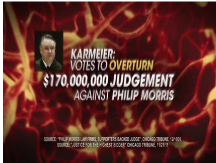
A MULTI-MILLION DOLLAR JUDGEMENT AGAINST THE TOBACCO GIANT FOR DECEPTION.