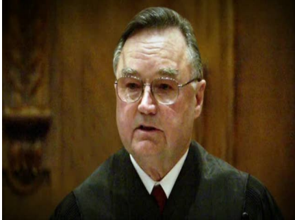
WHAT'S INSIDE THE MIND OF JUDGE LLOYD KARMEIER?

Brand: Campaign For 2016 - Political Organization (B329.1) Parent: PARENT UNKNOWN Aired: 10/19/2014 10:56:10 AM Creative Id: 14340913