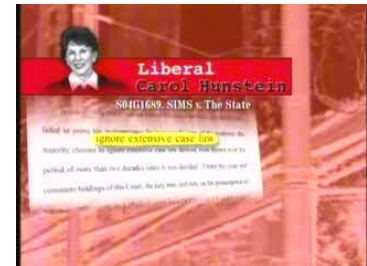
a jury to free a savage rapist.