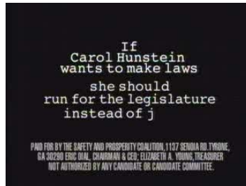
[PFBJ]: Safety and Prosperity Coalition