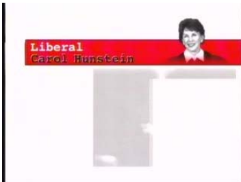
also voted to throw out evidence that convicted a cocaine trafficker,