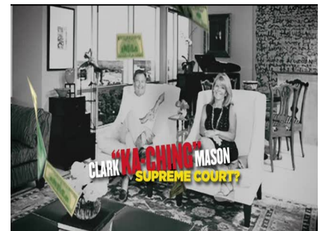
NOW "KA-CHING" WANTS TO SERVE ON THE ARKANSAS SUPREME COURT.