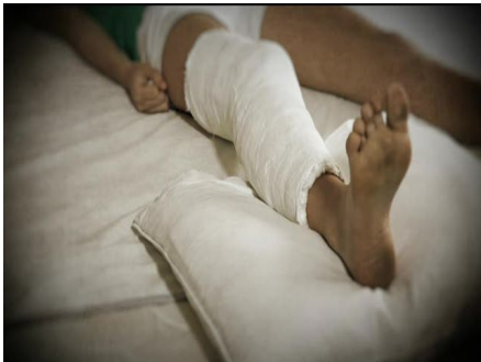
IT'S YOUR INJURY,