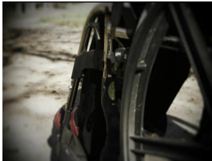
YOUR PAIN AND SUFFERING,