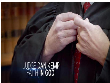
FAITH IN GOD,