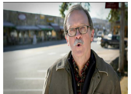
EVERY MORNING BEFORE I WALK INTO COURT,