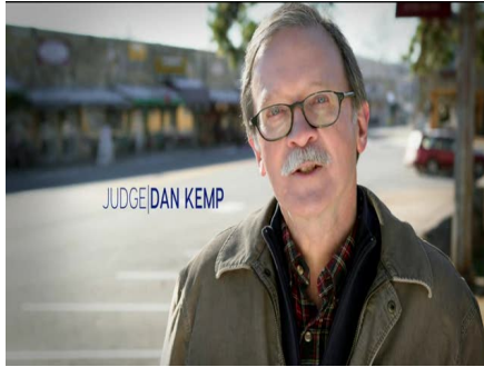
I WORKED IN MY FAMILY'S STORE