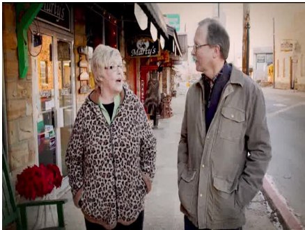
A LOTS CHANGED IN OUR SMALL TOWN.