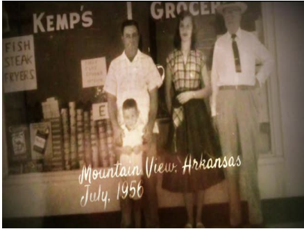
GROWING UP IN RURAL ARKANSAS,