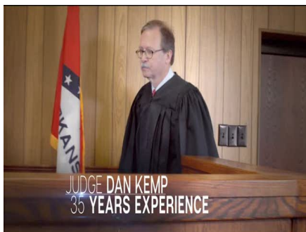
AND I'VE BEEN A JUDGE FOR OVER 35 YEARS.