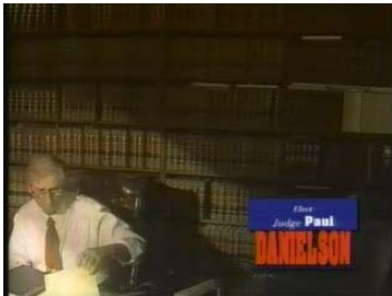
the only candidate in this race who has disposed of over twenty-two thousand criminal