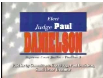
is clearly the best choice to be the next Supreme Court Associate Justice, position five.