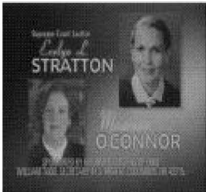
[PFB]: Stratton For Supreme Court Committee & NA/Candidate