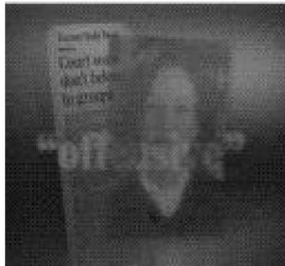
the Supreme Court oath because she knows an impartial judge takes no sides.