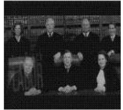
so that he would take labor's side. The Dayton Daily News called