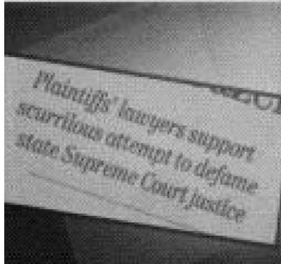
calls their campaign cowardly, deceitful, an insult to the