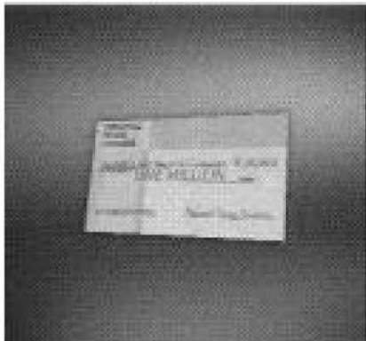
$1 million to attack Stratton and O'Connor? Maybe