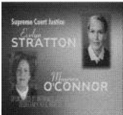
[PFB]: Stratton For Supreme Court Committee & NA/Candidate