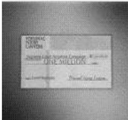
it's because they would rather have judges on their side. Stratton