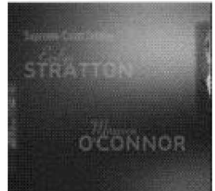
and O'Connor know that to be impartial judges there are to be no sides.