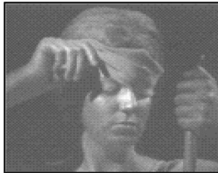
complained about a ruling Resnick made, Resnick became the only Justice