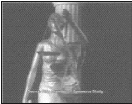
70% of the time. After a union leader and a big contributor