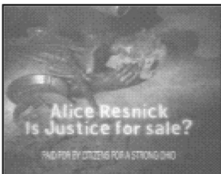
[PFB: Citizens for a strong Ohio]