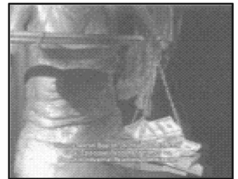
to reverse herself in the case. Alice Resnick. Is justice for sale?