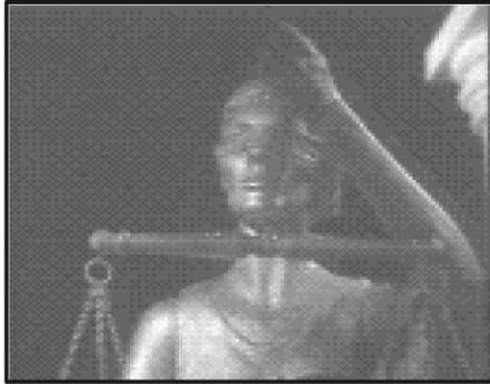
[Announcer]: Is justice for sale in Ohio? You decide. Since 1994, Justice Alice Resnick has taken over $750,000