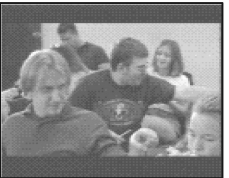
United States Supreme Court stood up for common sense and overturned