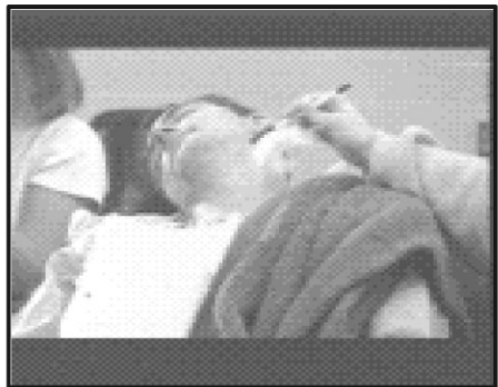
Resnick's decision stopped the legislatures effort to have instructors spend more time in the classroom.