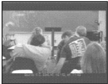
classroom teaching. But Justice Alice Resnick wrote a majority opinion