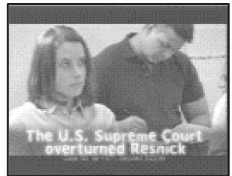
Resnick's holding in an 8-1 decision, so today in Ohio