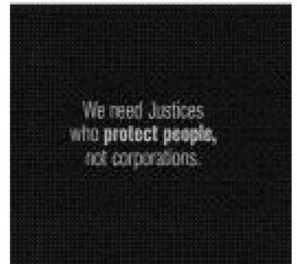
Ohio families get the hammer!" [Announcer]: We need justices that protect people, not corporations.