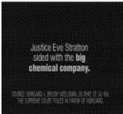
[Announcer]: Eve Stratton sided with the big chemical company.