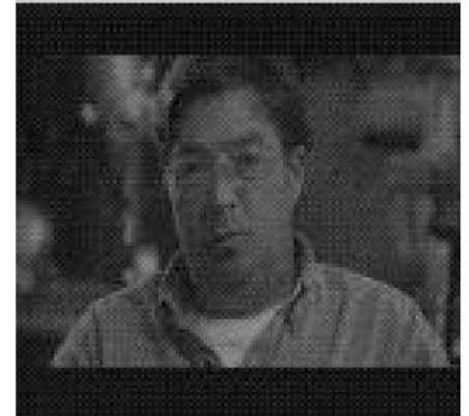
[Norgard]: "They lied about the risks, then they hid the evidence."