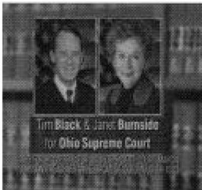
[PFB: Citizens for an Independent Court]