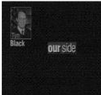
will put our courts back on the side of workers and families. Judges