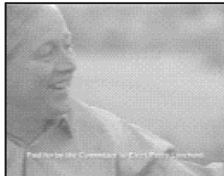
Mississippi Supreme Court.