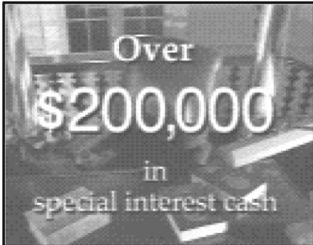
on our Supreme Court, even though she has almost no judicial experience and