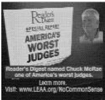
no common sense. [PFB]: Law Enforcement Alliance of America