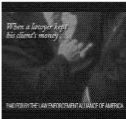
as promised, Mississippi's Supreme Court argued disbarment.