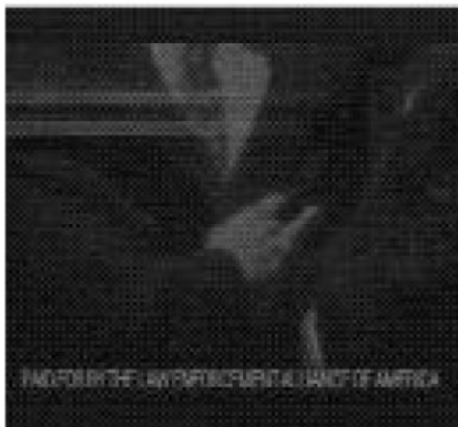
[Announcer]: When a Lawyer took his clients money instead of paying her doctor bills