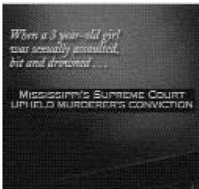
Supreme Court upheld the murderous conviction. Only Judge Chuck McRae