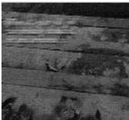
When a three year-old girl was sexually assaulted [Unintelligible], Mississippi